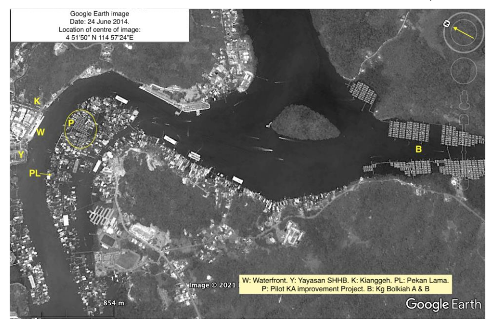
Fig.3. Organic vs. Planned Patterns.