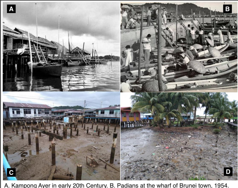
C. Silts of houses destroyed by fire. D. Trash pollution on shores of Bakut Pekan Lama.