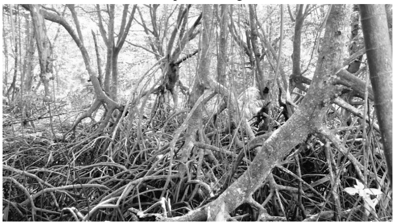
Fig. 4. Root Structure of the Rhizophora Mangrove

Another design solution would be to link the support structure by clustering. As mangroves grow and develop, the roots of individual trees intermesh to form a larger complex that support and enhance the stability of the whole cluster. This would also foster sedimentation, resulting over time in building land and raising the mangrove above the tidal level, away from erosive currents. Presently, individual KA houses are only tenuously connected via their links to the walkways that straddle the settlement complex. Drawing from the development strategy of mangroves, the support structures of individual houses could be interconnected by intermeshing them deliberately to strengthen the stability of the cluster rather than keep individual houses separated. This could be done by combining the structure with others to integrate multiple functions within the same structure, for example, sewage and trash management, and or food production. Natural structures are always multifunctional in design. Figure 4 shows the dense network structure of the Rhizophora mangroves.